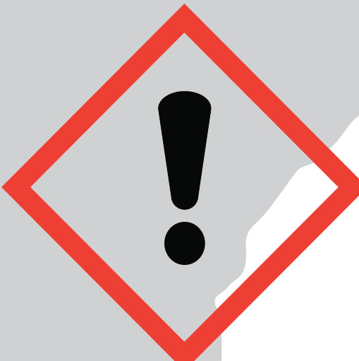
EXCLAMATION MARK irritant (skin, eyes) skin sensitizer acute toxicity narcotic effects respiratory tract irritant hazardous to ozone layer