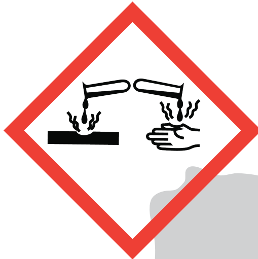
CORROSION skin corrosion/burns eye damage corrosive to metals