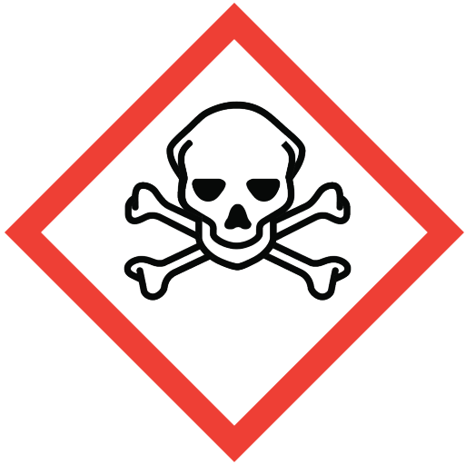
SKULLS & CROSSBONES acute toxicity (fatal or toxic)

THEY CAN SAVE YOUR LIFE. GET THE PICTURE?