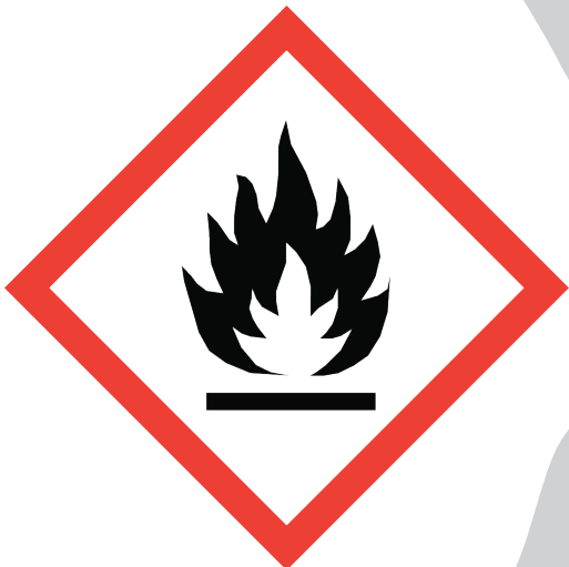
FLAME flammable pyrophorics self-heating emits flammable gas self-reactives organic peroxides