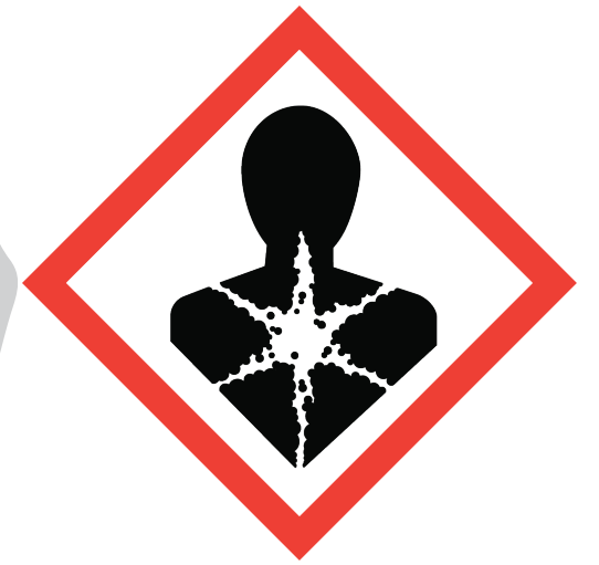
HEALTH HAZARDS carcinogen mutagenicity reproductive toxicity respiratory sensitizer target organ toxicity aspiration toxicity