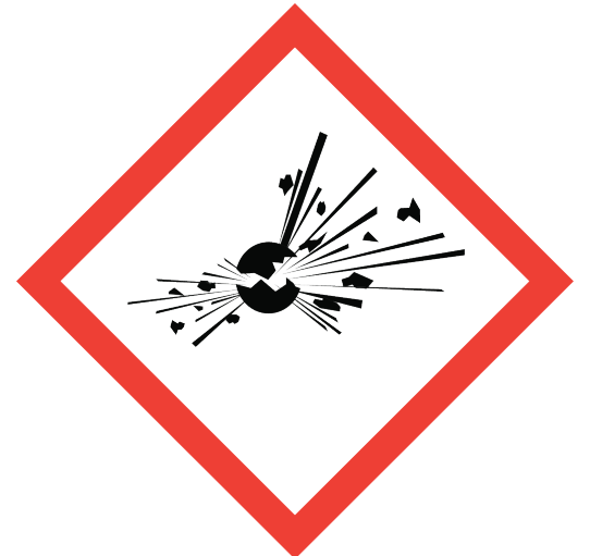
EXPLODING BOMB explosives self-reactives organic peroxides