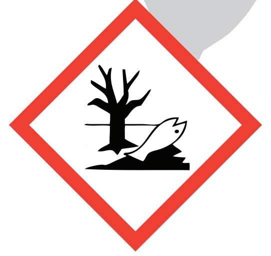
ENVIRONMENT aquatic toxicity