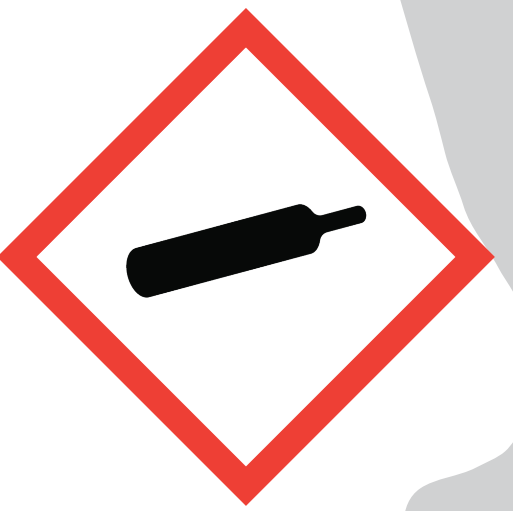
GAS CYLINDER gases under pressure